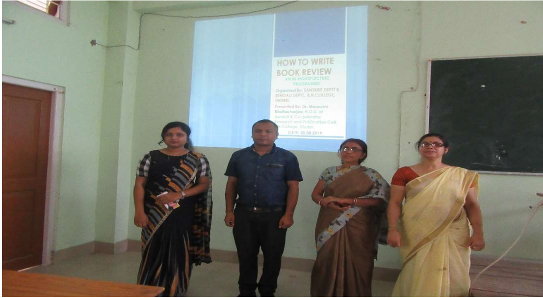
TEACHERS OF SANSKRIT & BENGALI DEPTT PRESENT IN THE OCCASION